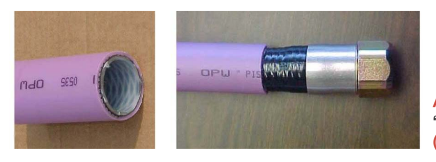
ADHESIVE TO USE FOR THIS PIPE: "ADHESIVE-PE-KIT" (REQUIRES "MAN-GUN-FS-10" TO DISPENSE)

First gen. OPW CP-15 and CP-20 pipe had either a blue or lavender polyethylene secondary and a black primary.