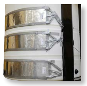
For Northern units only Maintains temperatures up to 120°F on polyethylene tanks